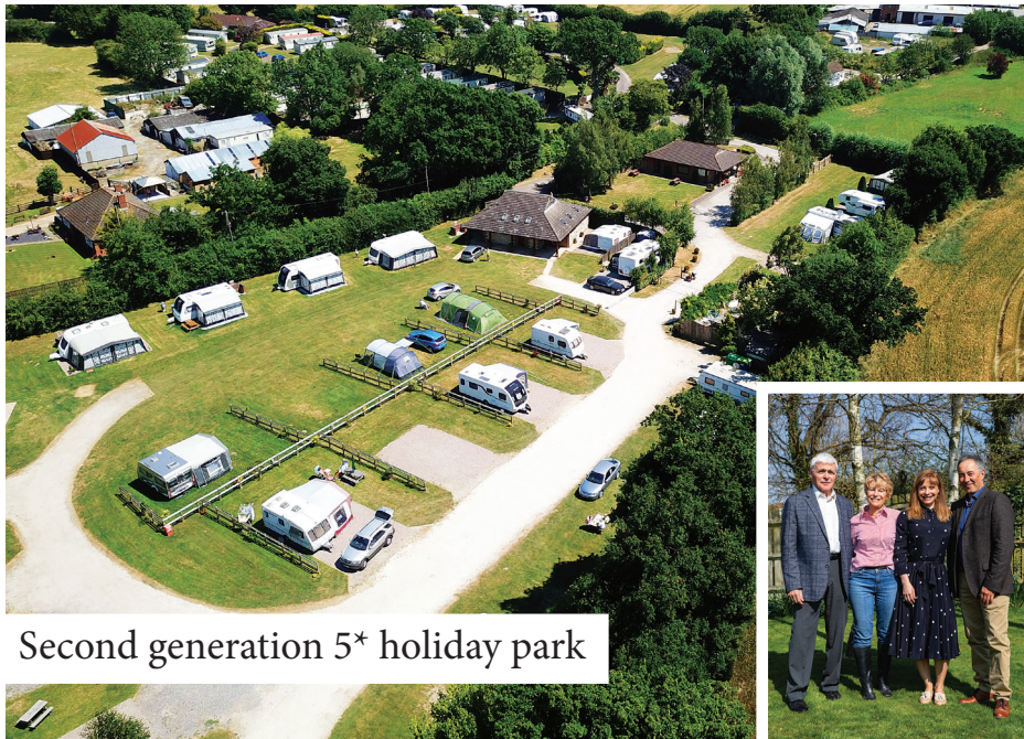
Second generation 5* holiday park

Family run and owned for over 50 years, our dedicated team of friendly staff take great pleasure in creating a truly memorable stay. Here at Broadhembury, you will find everything to make the perfect holiday, whether you are looking for that special family holiday, relaxing couples break, or simply a stop-over on the way to the Continent.