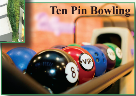
Ten Pin Bowling